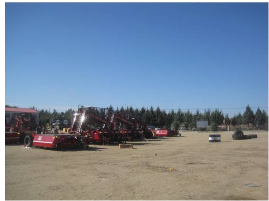
Amity Equipment being assembled in Jiusan

Ten Square was busy again this year preparing for the sugar beet harvest in China. Two major projects included the assembly and field commissioning of Amity harvesters and defoliators in the Jiusan Sub Division of the Heilongjiang State Farm Bureau, and the introduction of a sugar beet piling system in Baolongshan, Inner Mongolia, supplied by Double L.