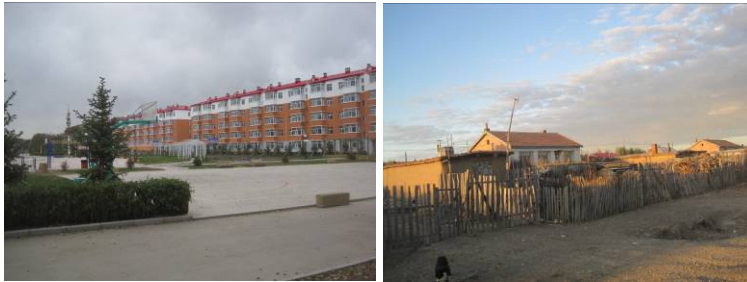
New housing in Fenglin (top left) and typical village near Yian (top right)

China, recognizing that the gap between urban and rural incomes and living standard is a major concern is spending considerable resources upgrading rural villages. The two pictures above are both in the vicinity of Yian, Heilongjiang. The new construction is in a village called Feng Lin 丰林. The housing features a central park, as well as small barns and greenhouses near the apartments to accommodate farmers' livestock and to allow them to grow some vegetables. It is quite surprising to be driving through a rural area and come upon the new high rise apartments.