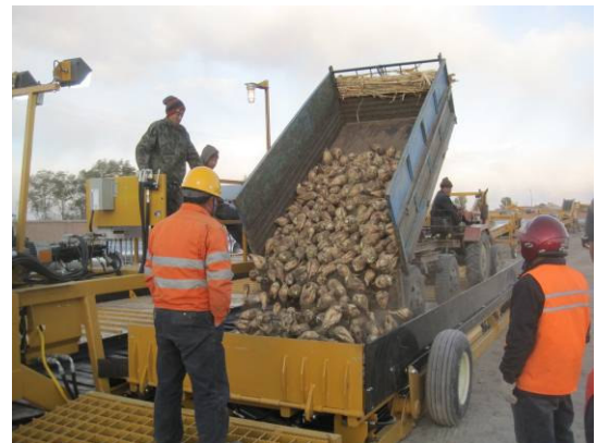
Double L receiving station at Baolongshan 宝龙山